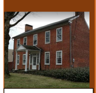
Meeker House Museum 2690 Stratford Road Delaware, OH 43015

The Barn at Stratford 2690 Stratford Road Delaware, OH 43015